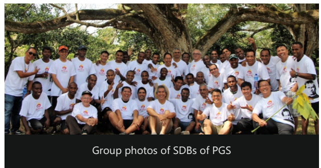
Group photos of SDBs of PGS

In 1980, the Salesians from Philippines opened the first Salesian presence in Papua New Guinea in one the poorest and least developed region known as the "Gulf Province". A place called ARAIMIRI was chosen to open a Secondary school, which was later upgraded to a Senior Secondary School (Grade XII level). This school was unique since it welcomed the unselected students to Grade IX. As per educational