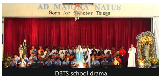
DBTS school drama

system, there is a public examination at the end of primary education, i.e. Grade VIII. Those who don't get a percentage could not get admission to Grade IX and they would be drop outs forever. The Salesians proved that with better environment and facilities, these so called 'drop outs' could be brought back to the mainstream. Boardings were opened for boys and girls and thanks to volunteers from Philippines and local teachers who dared to come and live in this remote malaria infected area with minimum facilities. Under very challenging situations, the school is a success story. Along with the school, faith formation and medical facilities improved and the people of the area grew in enthusiasm.