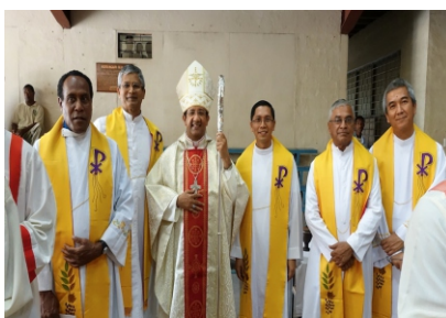
After Eucharist on 15th August 2017 at DBTS