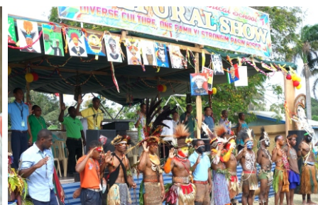
Leaders of cultural dances --students of DBTS