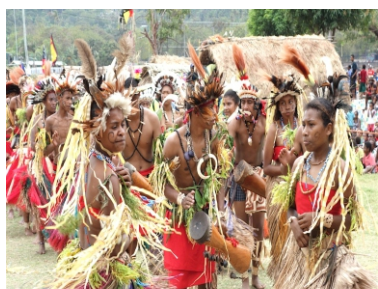
Cultural dance from the central province

I came to Tetere in February 2006. Apart from the Parish, we pioneered an agriculture-based Rural Training Centre, which has become a much sort after institute with hostels for boys and girls, pursuing a two-year course in agriculture. I have spent 8 years in Solomon Islands (4 years at Tetere: 2006-2009 and 4 at Henderson: 2013-16) and 3 years at Gabutu in PNG: 2010-12. In 2017, I have returned to PNG-SAVIO HAUS which has been moved to a new location just outside the city of Port Moresby. We have 16 young men from PNG and SI aspiring to become Salesian Priests and Brothers, while attending tertiary institutions.